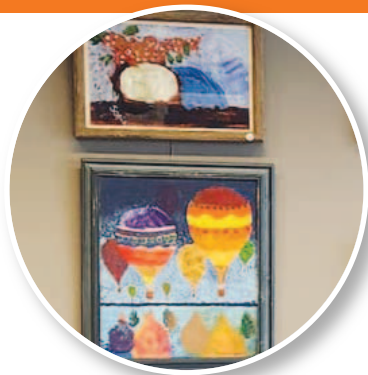
Framed Rainbow artwork decorated the lobby of the Florida Ballet.